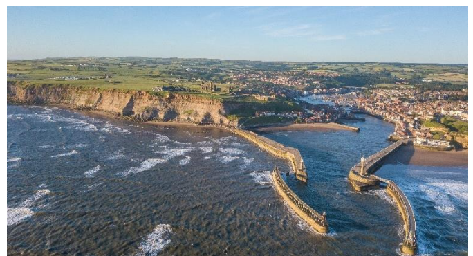
From top: Creative reuse of Horace Mills, Cononley, for housing; Ribbleshead Viaduct; oblique aerial view of Whitby from the east.