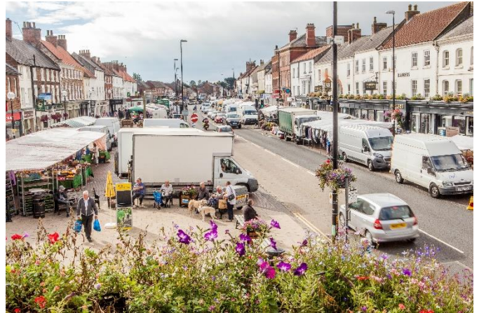
Northallerton on market day – a thriving commercial link to the town's history and development.

2.9 As local centres of economic and community gravity, market towns are a natural location for dispersed, diverse growth. In addition to taking some of the housing and employment development pressure away from York, the connectivity of the market towns opens a range of opportunities for business and people. The challenge for the historic environment is steering this change to the right locations, and taking cues from historic fabric and urban grain to enable development to fit within its context effectively and make a positive contribution to character. Similarly, understanding and anticipating the challenges and opportunities that the regional economy faces is key to unlocking the potential of under-used and under-appreciated historic building stock.