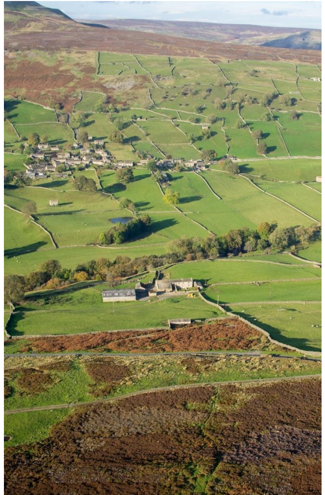
Historic farm buildings and field barns, Yorkshire Dales

2.16 While these landscapes have much in common with other agricultural areas, the unique combination of built and 'natural' heritage of designed landscapes brings its own challenges and opportunities. The key challenge for the historic environment is retaining the identity and distinctiveness of designed landscapes; securing resilience to the effects of climate change, conserving the settings of some of the country's finest stately homes and ensuring such places remain relevant – including through critical engagement with their sometimes-problematic history and sources of founding wealth.