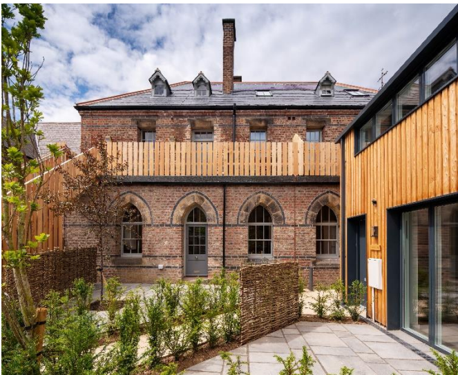
Creative re-use of historic buildings for residential use: former St. Joseph's Convent, York.

2.20 York faces many challenges, but perhaps the key issue for its historic environment is the need to positively manage its unique heritage in the face of the need to radically decarbonise in the coming decades. While the urban fabric of the city centre is unlikely to change significantly, the ways in which people and goods access the centre needs to change – in line with City of York Council's aspiration to be carbon neutral by 2030 . As a key commuter hub, commercial centre and university city this poses many questions – the answers to which have significant potential, but also risks.