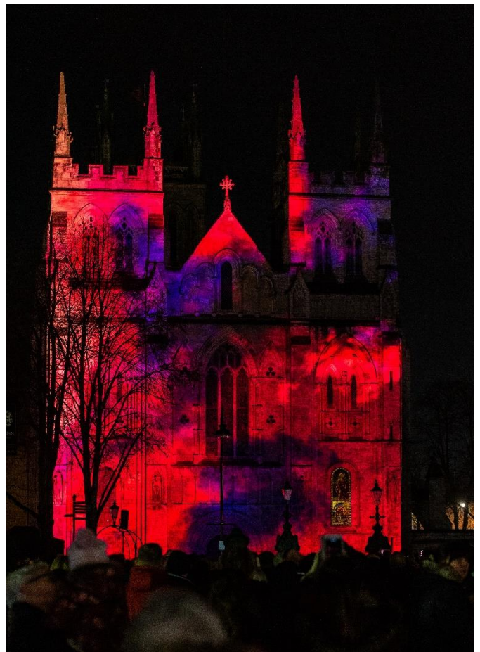
Selby Abbey, dramatically lit during 2019's festivities to celebrate the 950 th anniversary of its foundation. Social and cultural events that connect people to their places and heritage are valuable in building appreciation of the value of local assets – and in generating business opportunities.

Forthcoming planning reforms potentially offer an opportunity to provide clarity, through new design codes and sustainability guidance, on the expectations on new design in historic places.